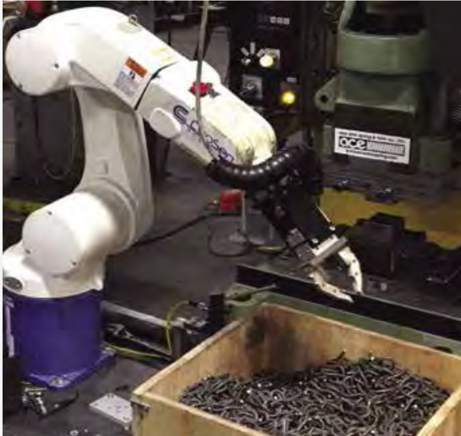
India Springs Inc.'s CapSen robotic arm has isolated a hook and is about to put it on a peg before swedging it.

The Precise PAVS6 has a maximum payload of 7 kg when the gripper is pointed down at an angle of plus or minus 45 degrees. It has a maximum payload of 6 kg when the gripper is pointed up at an angle of plus or minus 45 degrees.