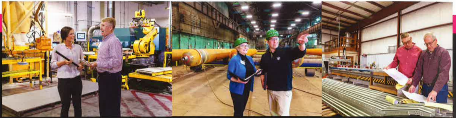
Catalyst Connection is a private not-for-profit organization headquartered in Pittsburgh. It provides consulting and training services to small manufacturers in southwestern Pennsylvania, accelerating revenue growth and improving productivity.

She also notes that many of the large-scale IT projects in the region are using local companies rather than bringing in vendors from outside the area, as was the generally case until the past few years.