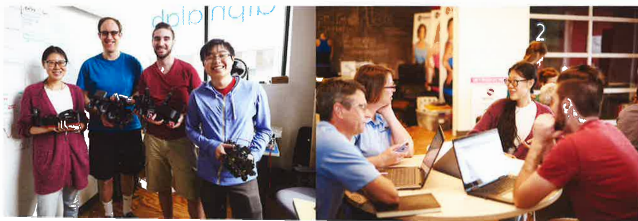
The financial and advisory assistance that AlphaLab Gear offers enables companies to prototype and scale their inventions over a 30-week period.